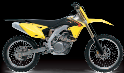
Champion Yellow No.2 / Solid Black (GY8)